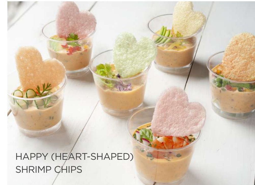
HAPPY (HEART-SHAPED) SHRIMP CHIPS