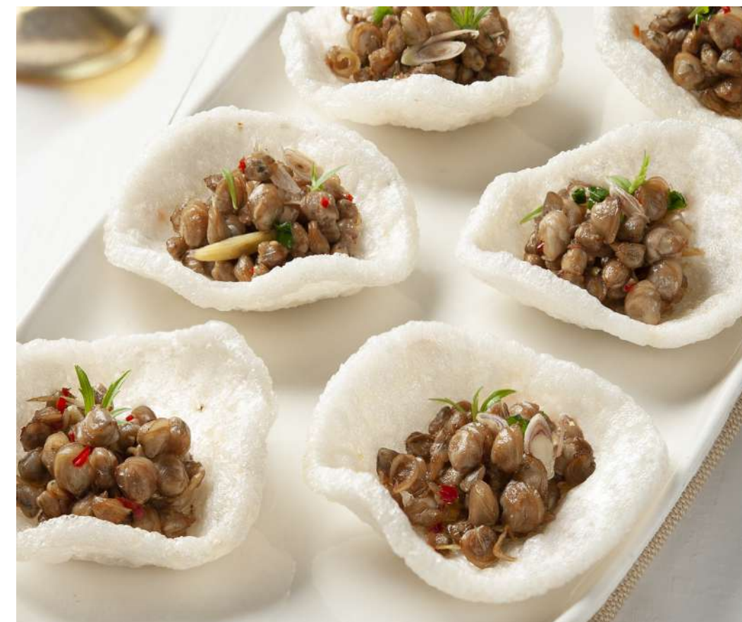
Stir-fried baby clams served with shrimp chips