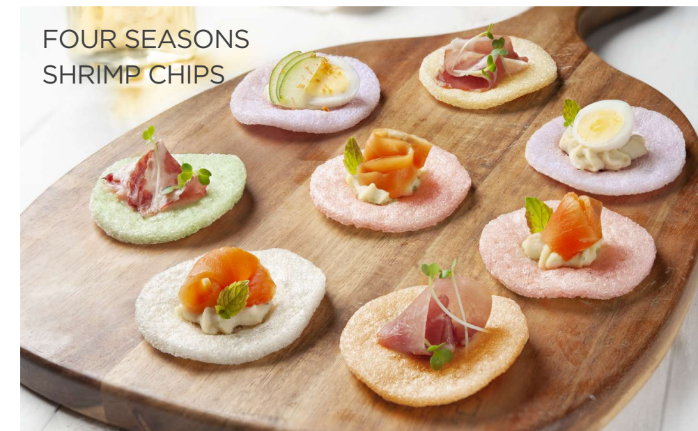
FOUR SEASONS SHRIMP CHIPS