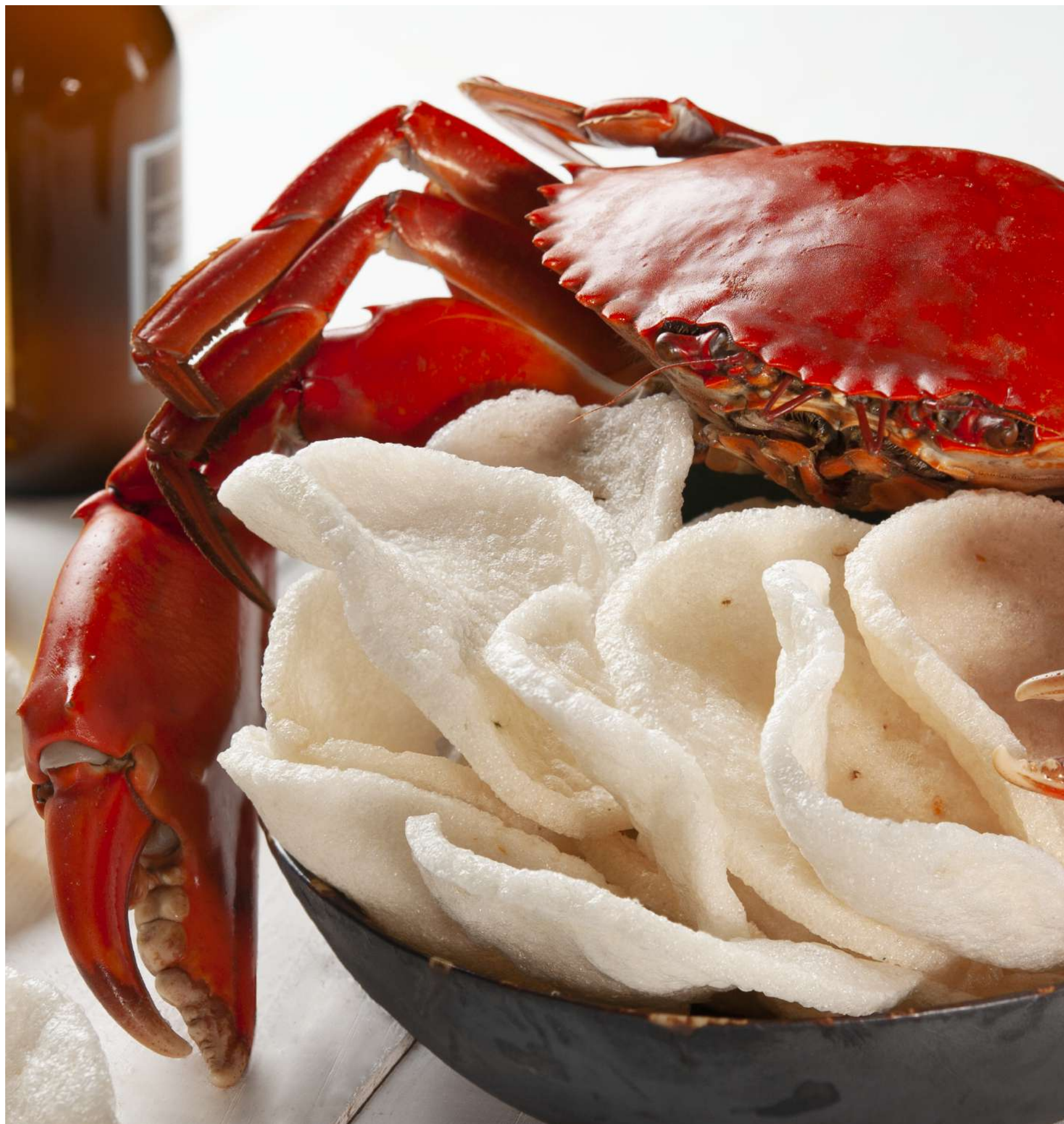
A crab soup made with crab chips