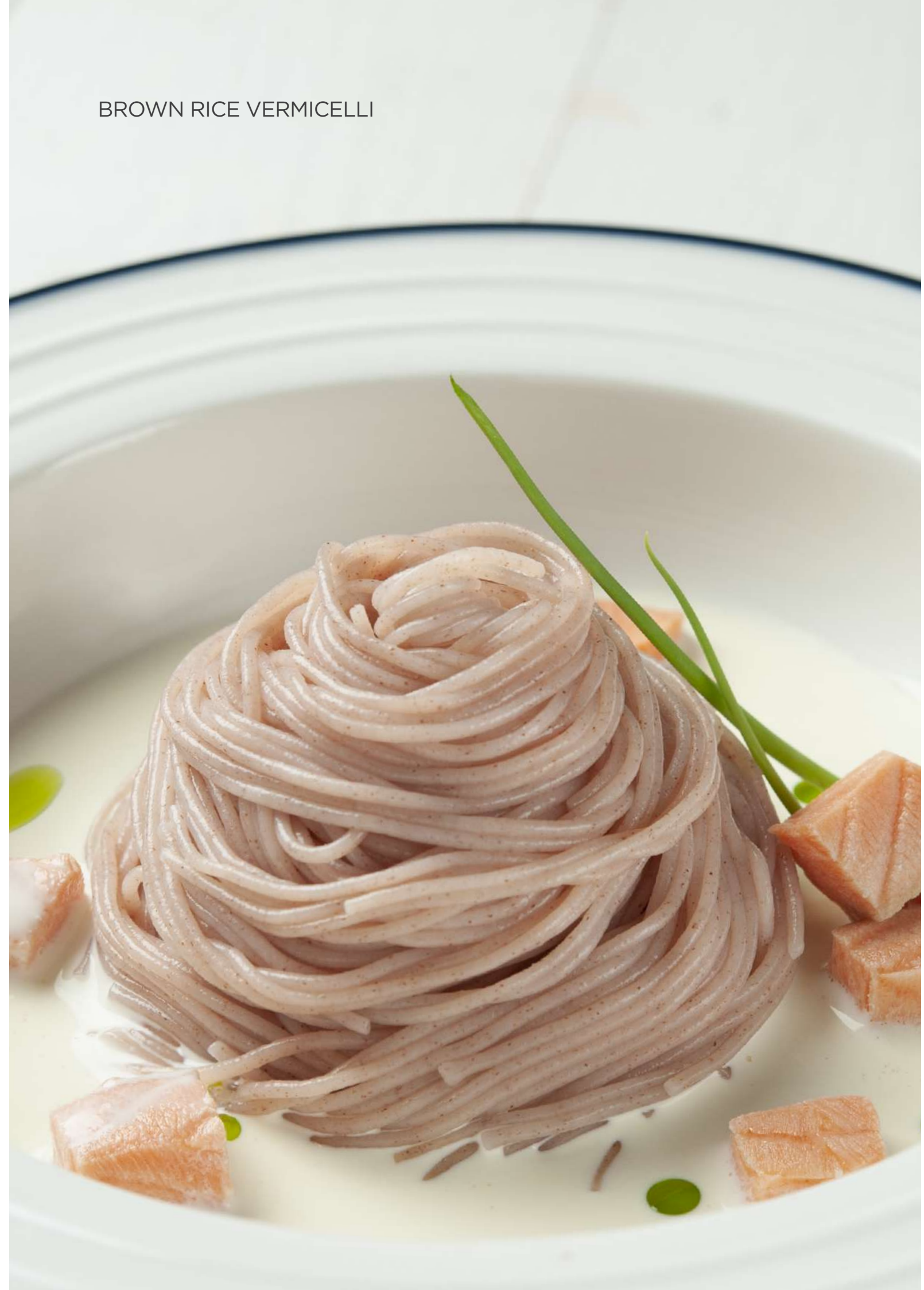
BROWN RICE VERMICELLI

At Sa Giang, we always look for new challenges and catch up with upcoming trends. You can find in our catalog the famous Pad Thai Rice Noodles and the nutritionally trending brown rice vermicelli, and much more.