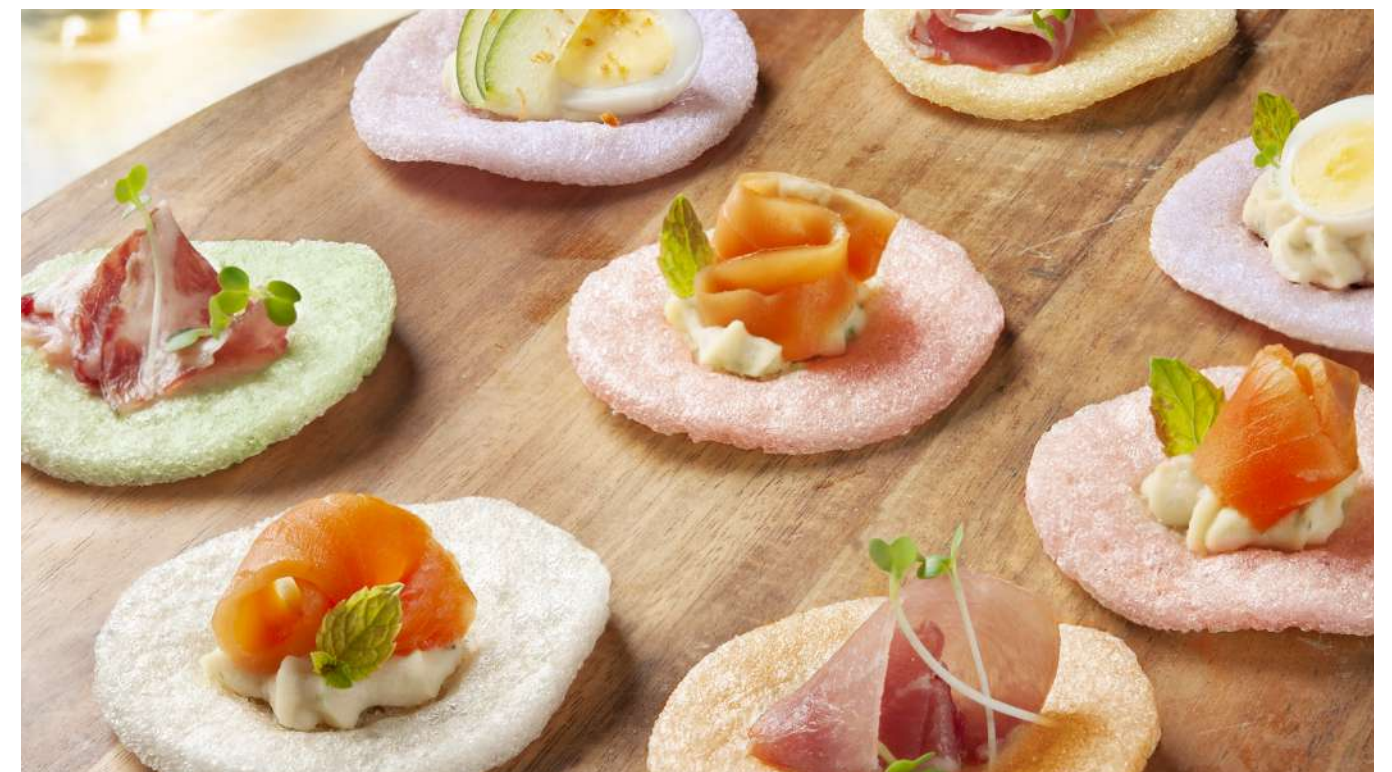
Seafood finger food served with shrimp chips