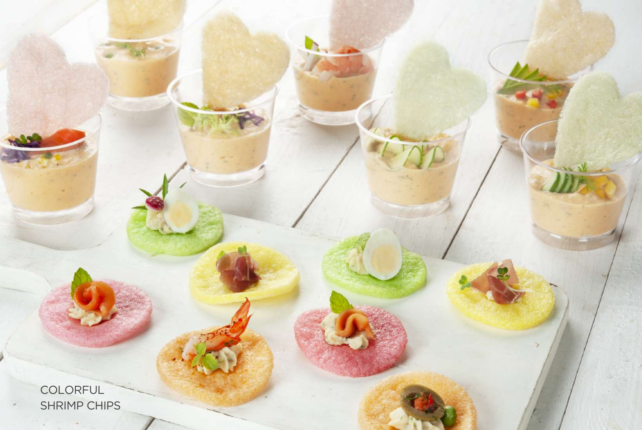
COLORFUL SHRIMP CHIPS