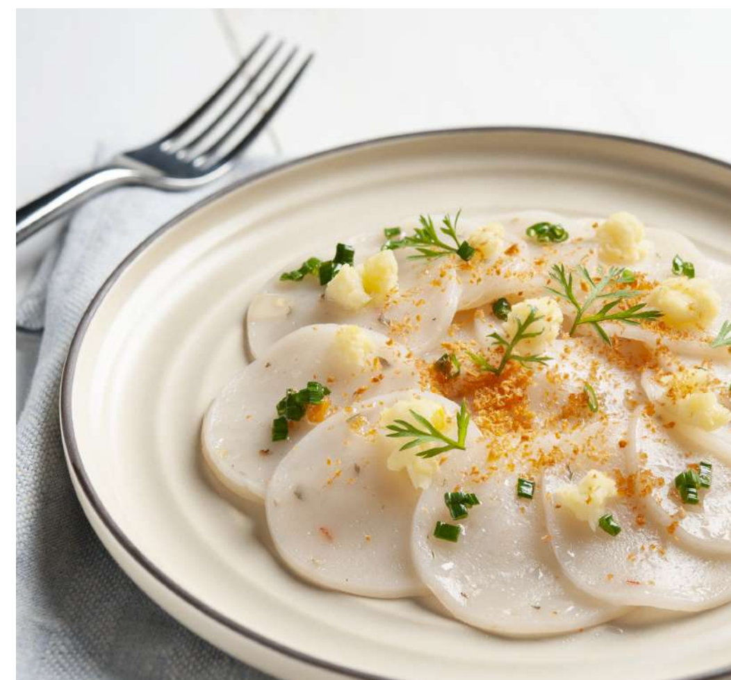
Hue's famous water fern cake made from shrimp chips