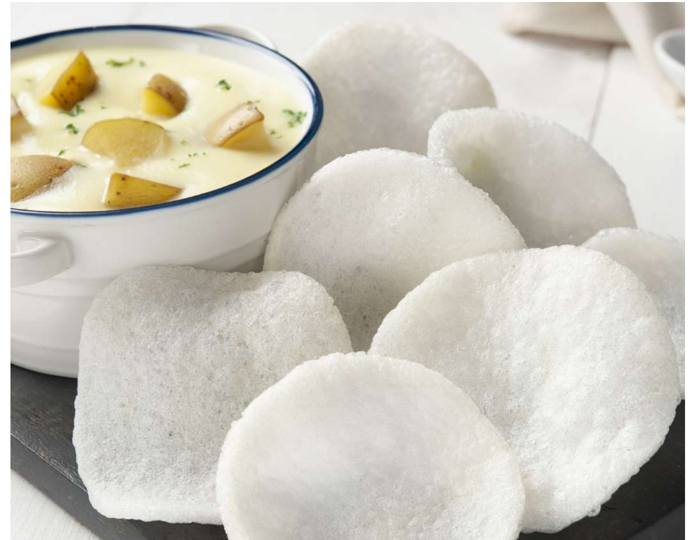
Shrimp chips served with potato soup

Shrimp Chips originated in Southeast Asia around the 9th or 10th century, and people love to have them during family gatherings. They are loved for their crispy texture and natural seafood sweetness. Today, shrimp chips are not only attached to any culture but also are served alongside salads or appetizers on different menus at restaurants around the world. In addition to seafood chips, we also develop vegan chips with natural vegetable ingredients and ready-to-eat shrimp chips, even certified organic that is suitable for modern nutrition trends.